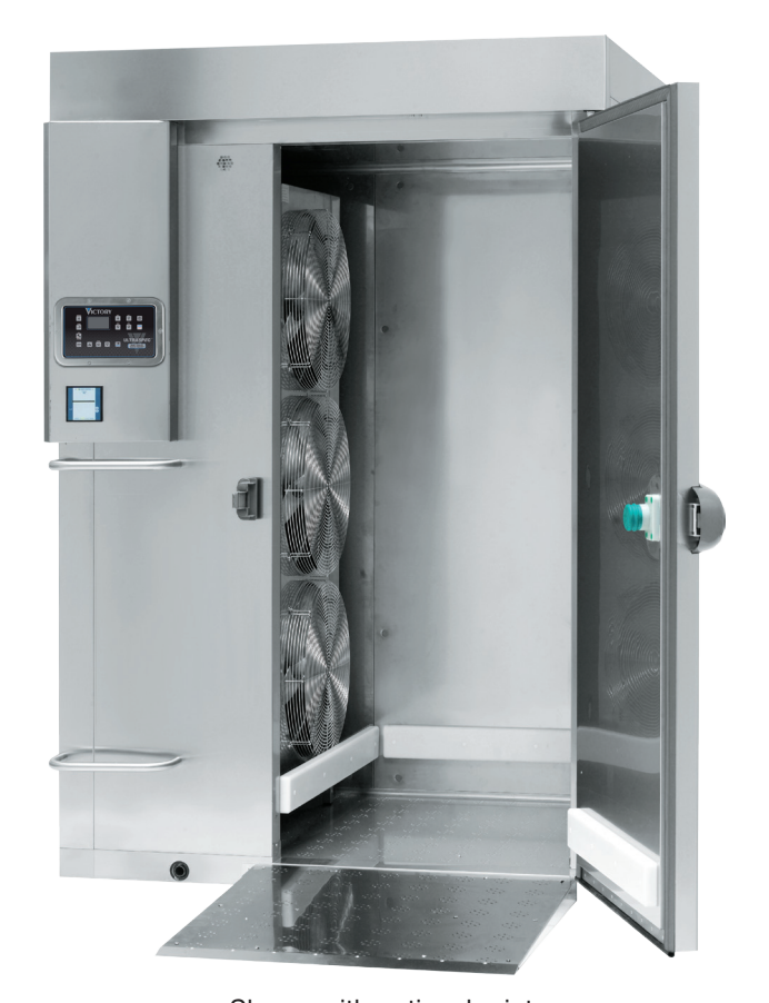
Shown with optional printer.