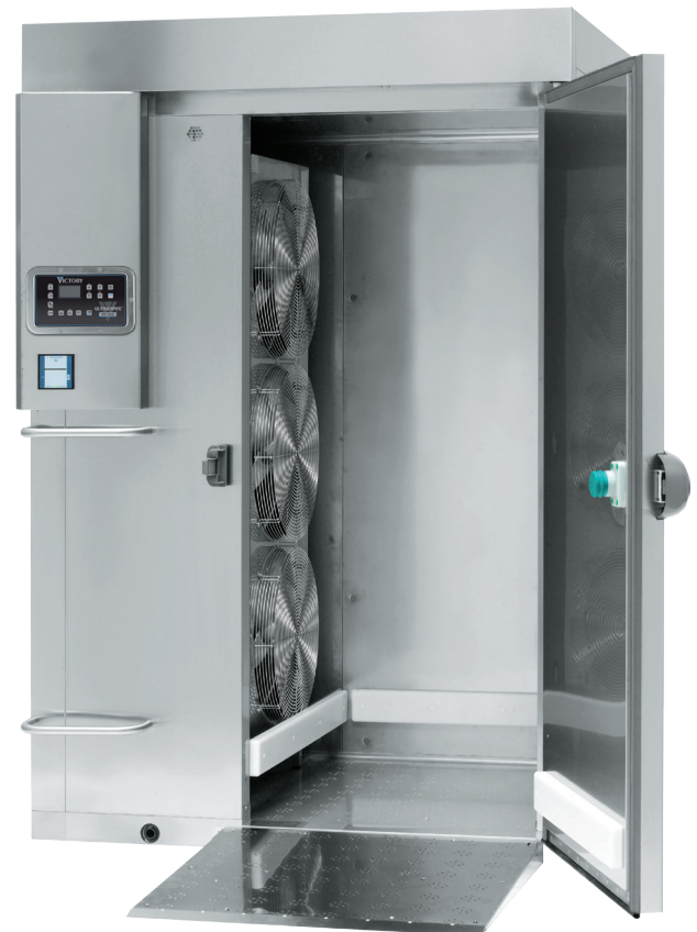
Shown with optional printer.