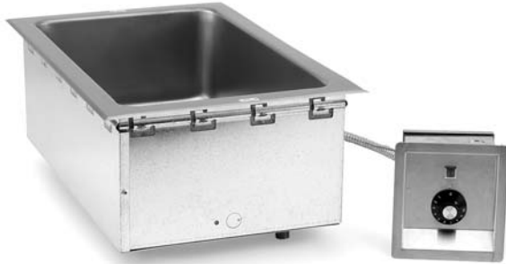
Modular Drop-In: Top Mount Fabricator Well