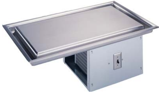
Modular Drop-In: Refrigerated Frost Top