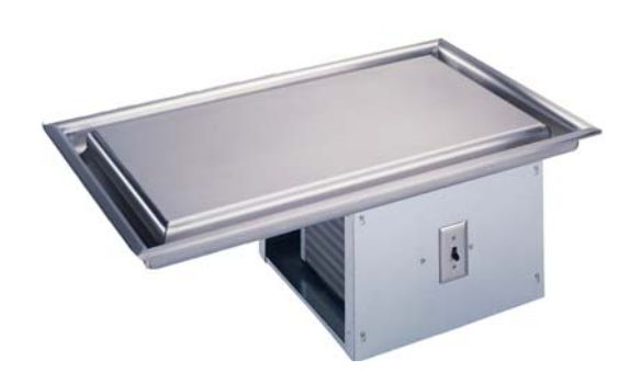
Modular Drop-In: Refrigerated Frost Top