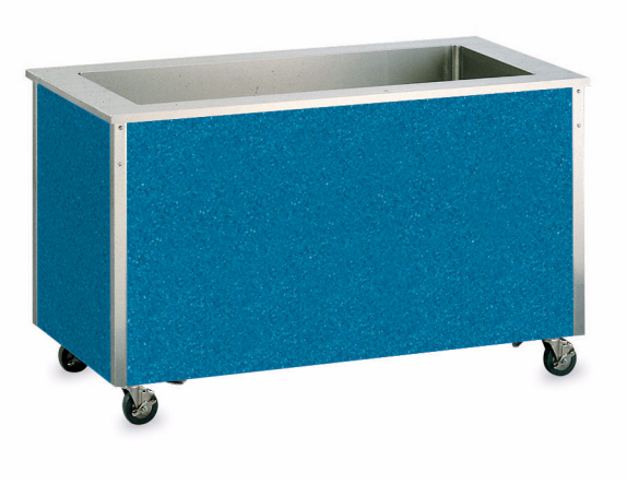
Signature Server<sup>®</sup> Classic Cold Food Stations