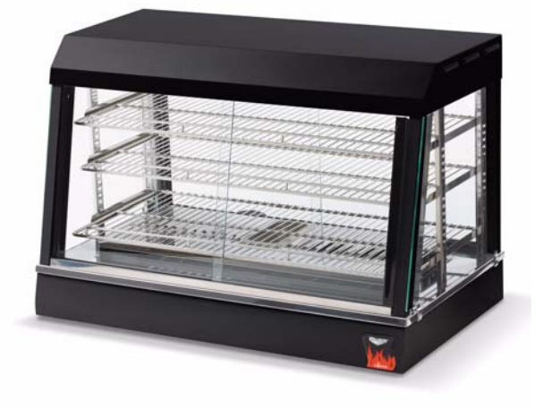
Cayenne<sup>®</sup> Hot Food Merchandiser