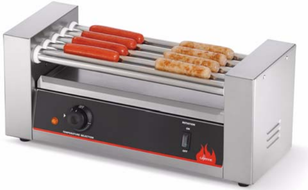
Cayenne® Hot Dog Roller Grill