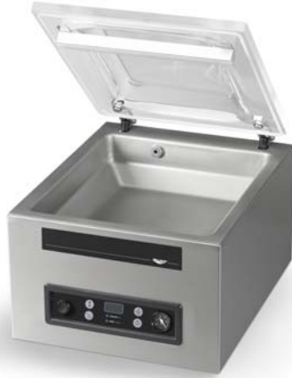
Vacuum Packing Machine with 12" Sealing Bar