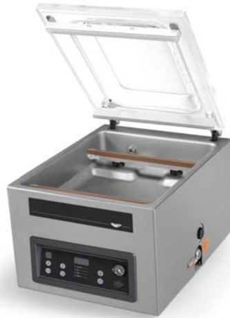
Vacuum Packing Machine with Dual 16" Sealing Bars