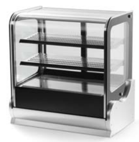
Front Access Curved Cabinet