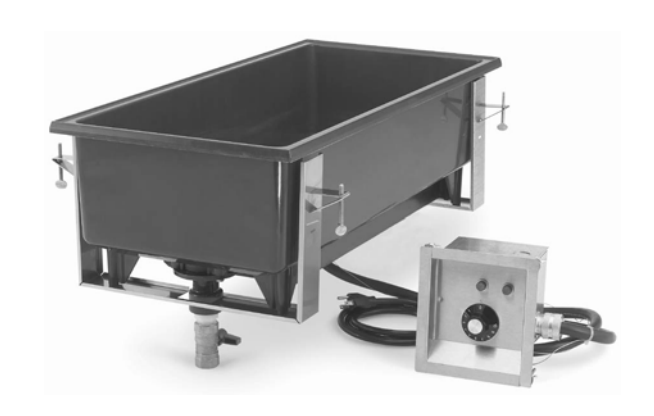
4/3 Thermoset Drop-in Warmer