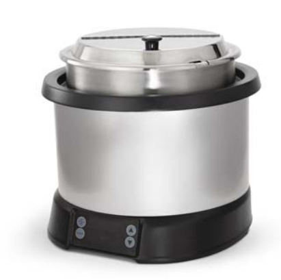
Mirage<sup>®</sup> Induction Rethermalizer