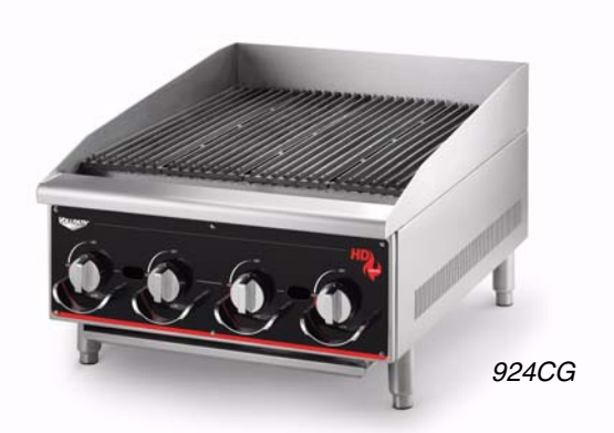
Cayenne® Heavy-Duty Charbroiler