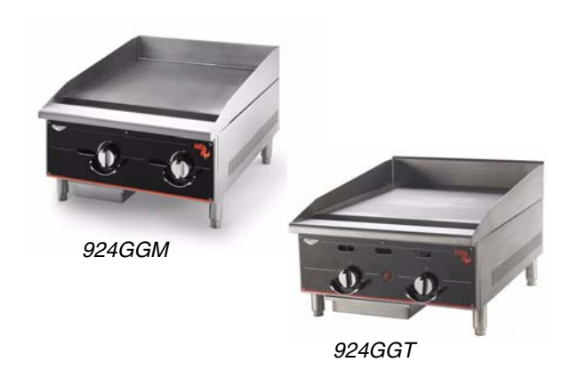
Cavenne® Heavy-Duty Gas Flat Top Griddles