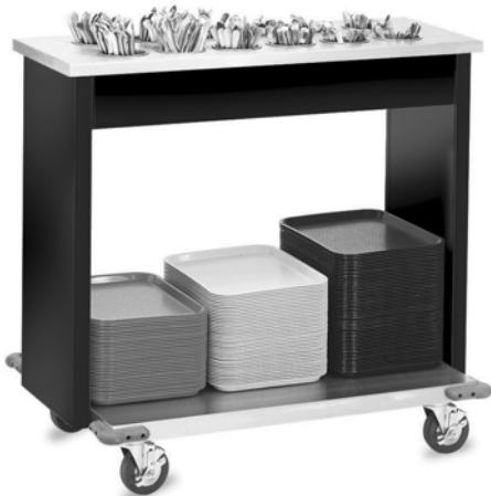
Black Vinyl base pictured.