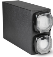
Shallow Cabinet LidSaver™ 2