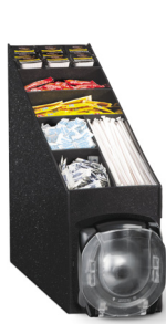
Countertop LidSaver™ 2 and Condiment Organizer