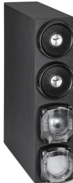
LidSaver™ 2 Cabinet