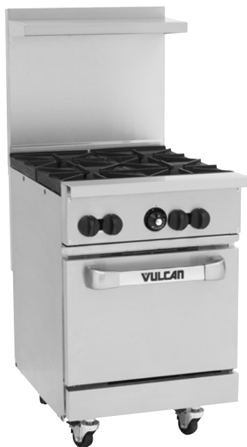
Model 24S-4N (shown with optional casters)