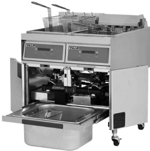
Model 2ER85DF Shown on casters (Accessory)