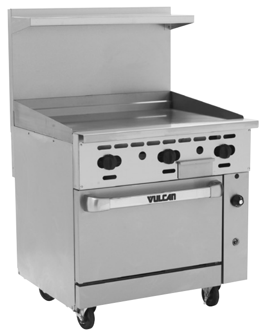
Model 36S-36GN (shown with optional casters)