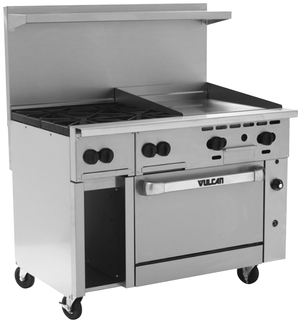
Model 48S-4B24GN (shown with optional casters)

4 OPEN BURNERS / 24" GRIDDLE 48" WIDE GAS RANGE