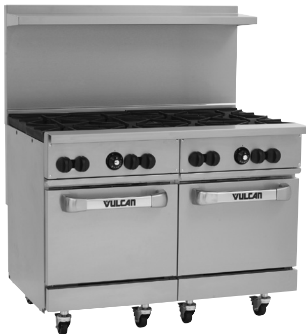
Model 48SS-8BN (shown with optional casters)