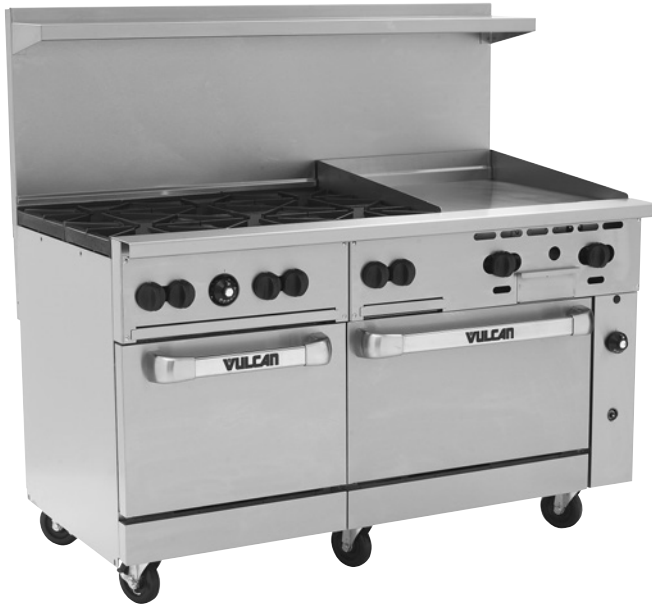
Model 60SS-6B24GBN (shown with optional casters)