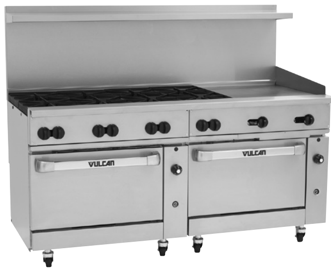
Model 72SC-8B-24G-N (shown with optional casters)