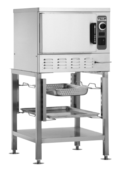
Shown on optional stand with extra set of pan slides and pans