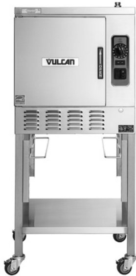
Shown on accessory stand with extra set of pan slides and pans