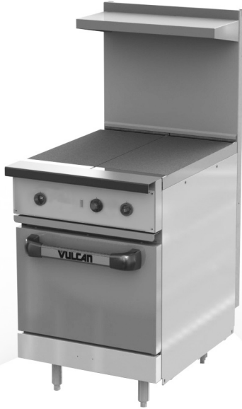
Model EV24S-2HT208 shown with adjustable legs