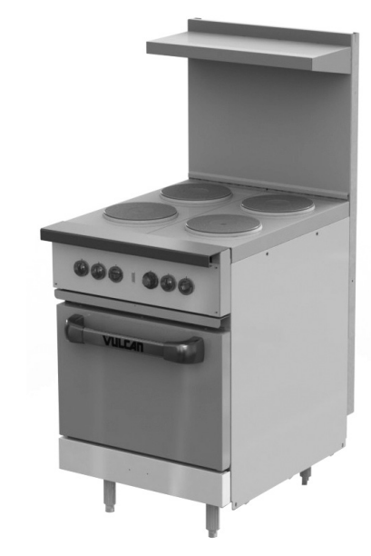
Model EV24S-4FP208 shown with adjustable legs