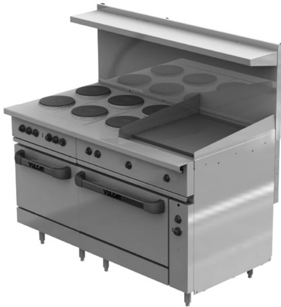
Model EV60SS-6FP24G208 shown with adjustable legs