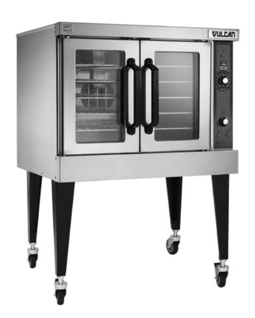
Model VC6GD Shown on optional casters