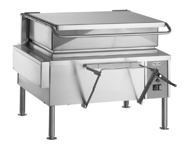
Shown with enclosed faucet bracket