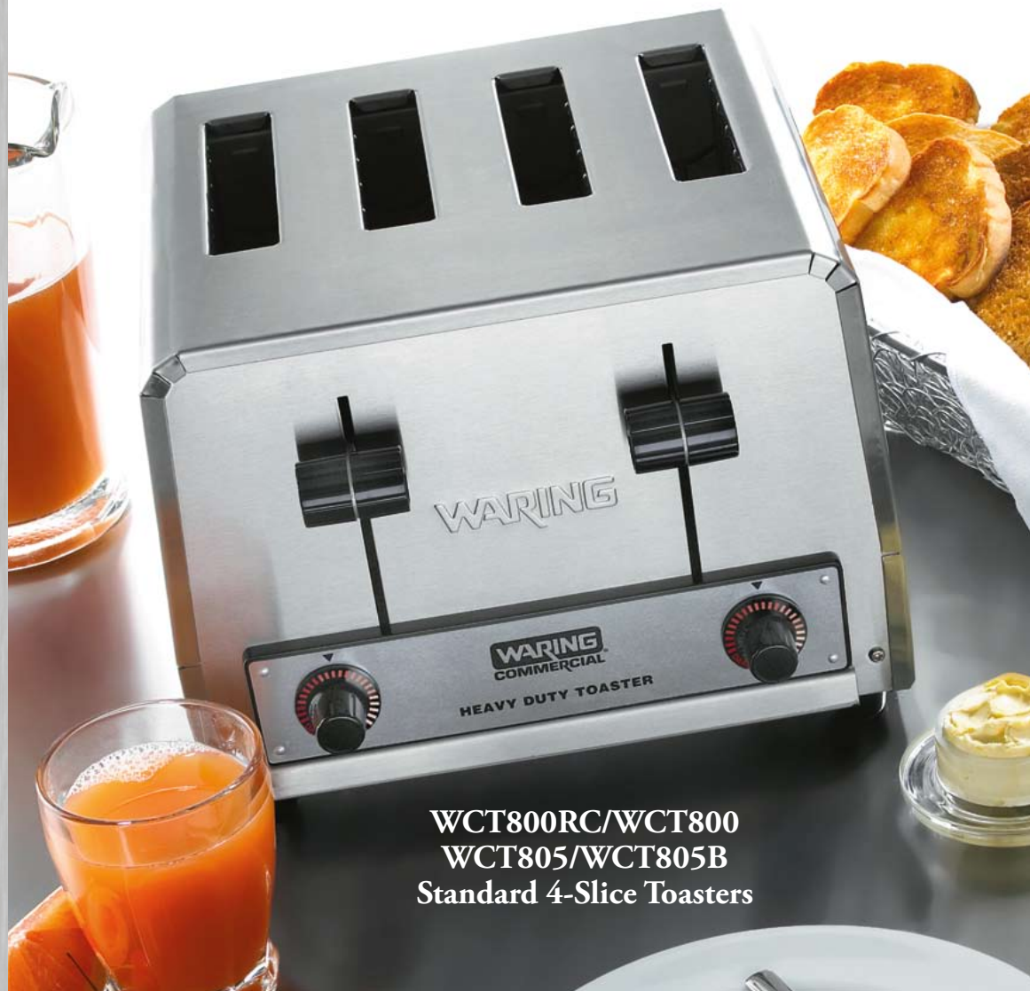
WCT800RC/WCT800 WCT805/WCT805B Standard 4-Slice Toasters