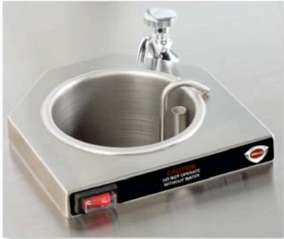
Model HDW-2 (front view with optional faucet)