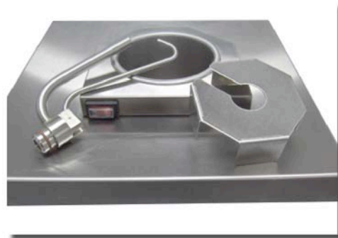
Quick & Easy Drain Lever