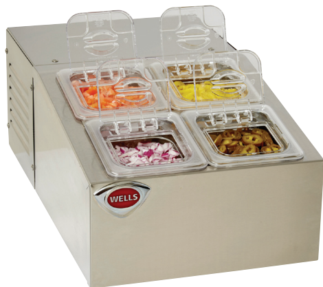
Model RCTS-4 (food not included)