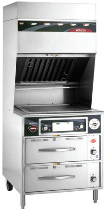
Model WV2HGRW SHOWN