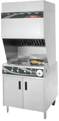
Model WV4HS SHOWN