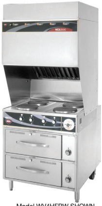
Model WV4HFRW SHOWN