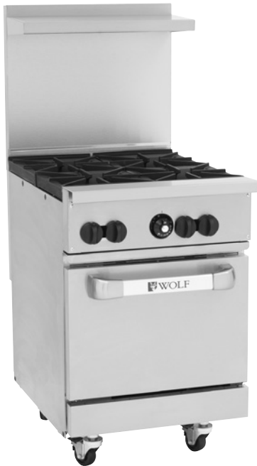
Model C24S-4BN (shown with optional casters)