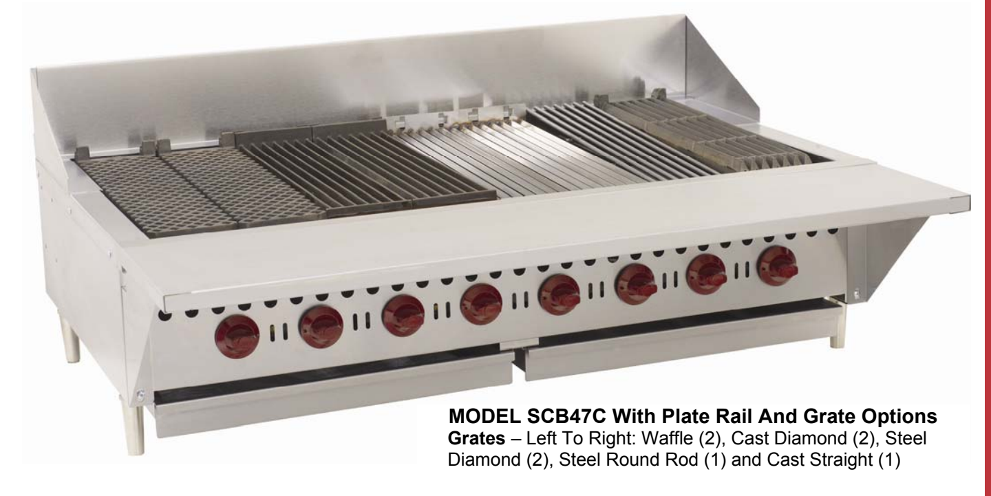
PLATE RAIL BACKSPLASH CAST IRON DIAMOND GRATE STEEL DIAMOND GRATE CAST IRON STRAIGHT GRATE STEEL ROUND ROD GRATE CAST IRON WAFFLE GRATE